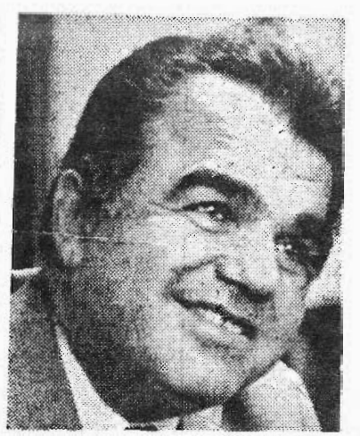
Unlikely Majority booster

It is interesting and instructive to contrast the activities of Batmanghelidj with those of Ismail Mer-