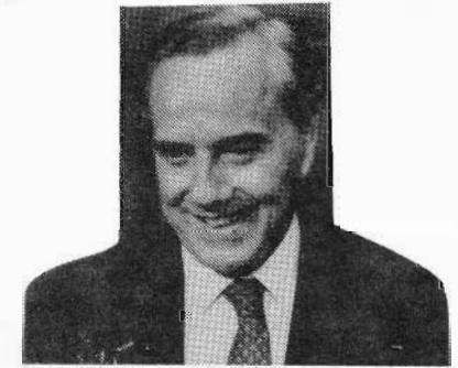
In search of Jewish dollars

from Tel Aviv to Jerusalem. This would be a body blow to the Palestinians who consider Jerusalem, especially the eastern part of the Holy City, as their own capital.