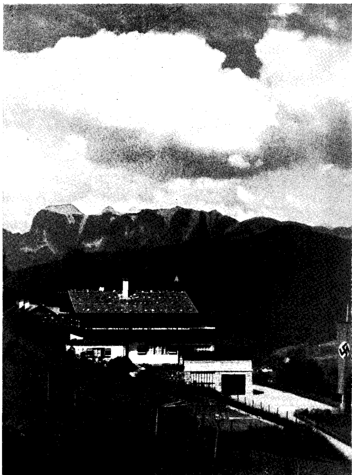
THE BERGHOF, THE FÜHRER'S COUNTRY HOME IN THE OBERSALZBERG, BAVARIAN ALPS