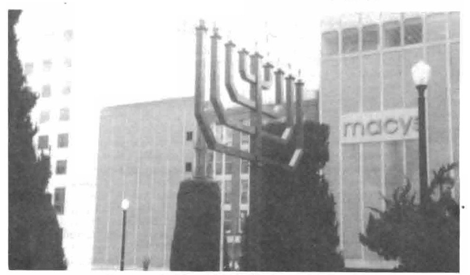
The menorah casts a long shadow over San Francisco

Last year two bullets slammed against a Los Angeles bus after it had swerved to avoid a collision. In June, after a fender-bender on a Hollywood street, the driver of a mildly dented vehicle pulled out a gun from the trunk of his car and shot one person dead and wounded another. In August a mother rushing her son to a hospital in a van was killed by a shotgun blast from a driver she was trying to pass.