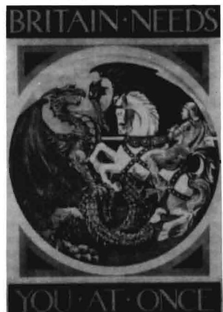
WWI Recruiting Poster

widespread habit of hypostasizing, reifying and stereotyping entire nations and ethnic groups was exploited to the utmost. People on both sides of the conflict were taught to regard the enemy nations as wholly evil, to be combatted with the utmost ferocity and, when conquered, to be punished without mercy. Individual acts of