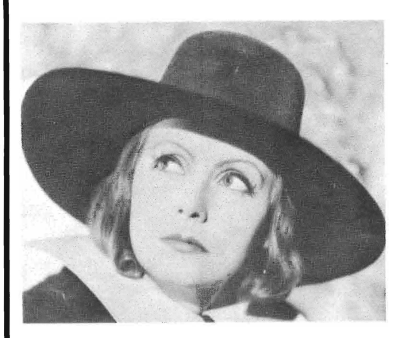
Garbo as Queen Christina (1933)

The decades wrinkled away her radiance, but time and old age could not erase the fact that out of the lower depths of our unique race (her father was a Stockholm privy cleaner) emerged an almost supernatural "presence" that faithfully mirrored all the beauty of the most beautiful race.