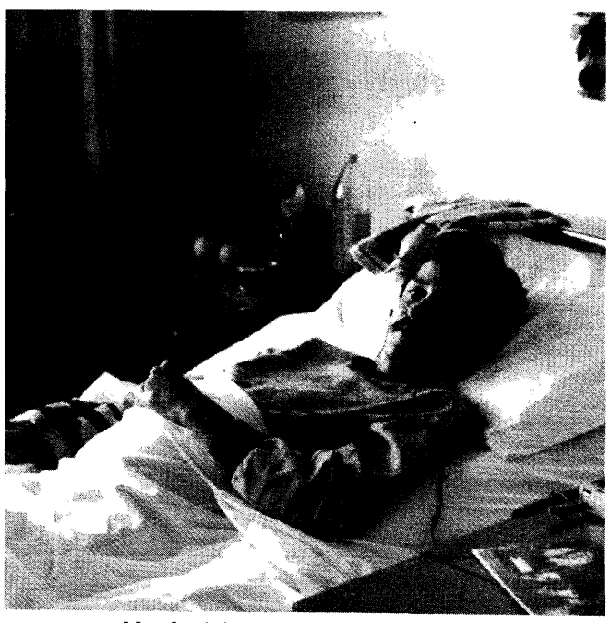
A 17-year-old Palestinian paraplegic, shot during a demonstration and visited by the author a year later. There are no funds for his rehabilitation.

For a number of reasons, no reliable figures of dead or wounded exist. Figures for those killed by the Israelis refer only to those shot to death or beaten to death on the street. There is no official record of those Palestinians who are shot or beaten and later die in hospitals or at home. Many wounded or injured Palestinians refuse to go to a hospital for fear of the soldiers, who demand to see lists of all patients. If a Palestinian is admitted with a gunshot wound or fractured bones as a result of beatings, and the Israeli military authorities want him for "trial," he is dragged out of his bed, thrown into a jeep and taken to jail. Many of the wounded prefer to seek medical care from "underground medical committees" rather than face arrest and interrogation, beatings and finally imprisonment.