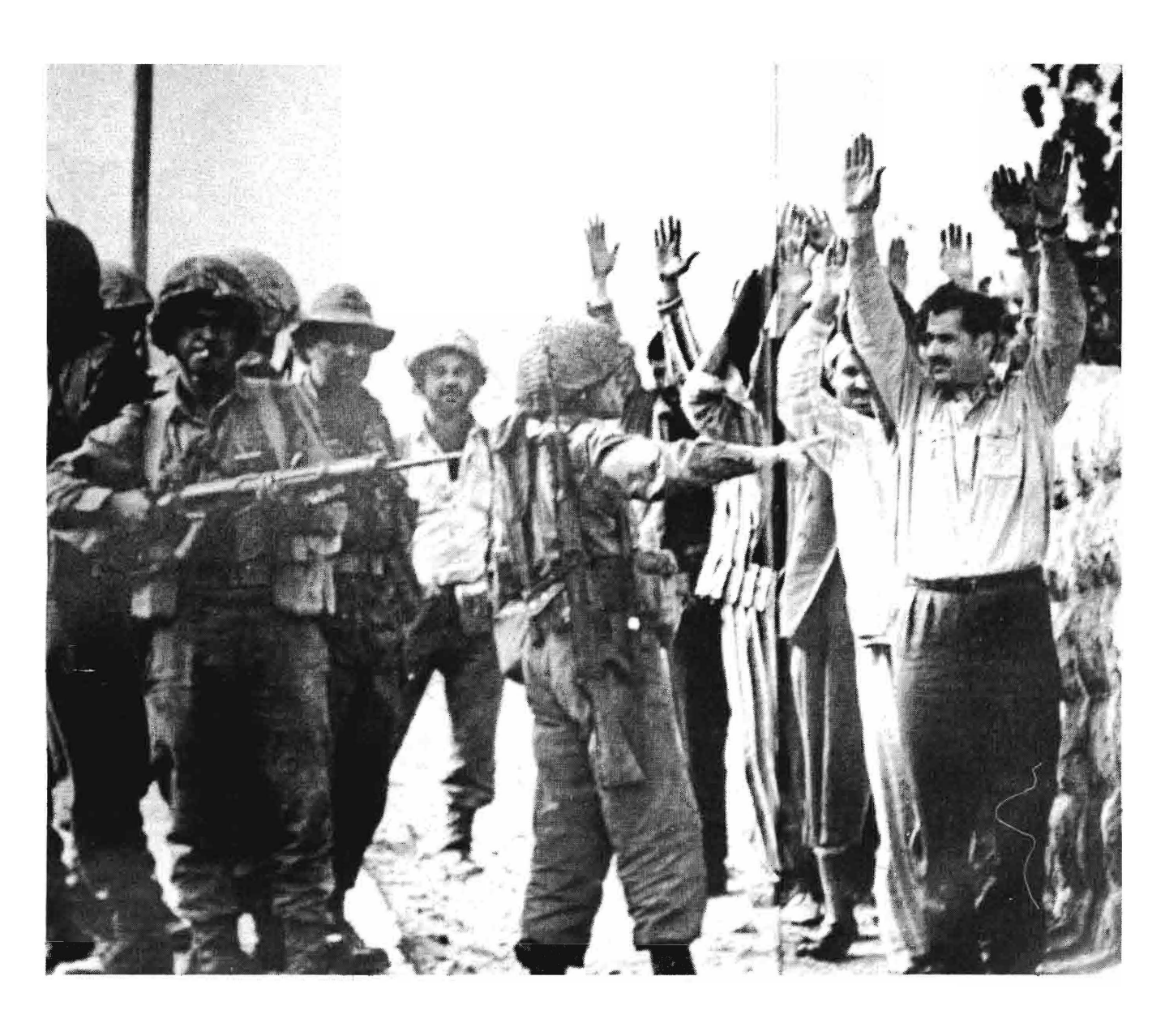
THE MISERY OF THE PALESTINIANS -- AN EYEWITNESS REPORT