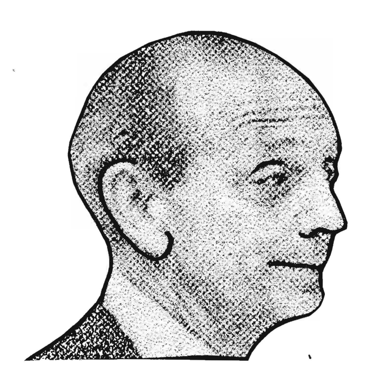
Stephen G. Breyer will be the 108th Supreme Court Justice. Ruth Bader Ginsburg, Clinton's first shot at packing the Court with the Chosen, is the 107th.

It's an old adage of government that when things go wrong at home, heads of state take peoples' minds off their troubles by cooking up some dramatic military adventure abroad. Presidents then become commanders-in-chief and are less exposed to the slings and arrows of domestic politics.