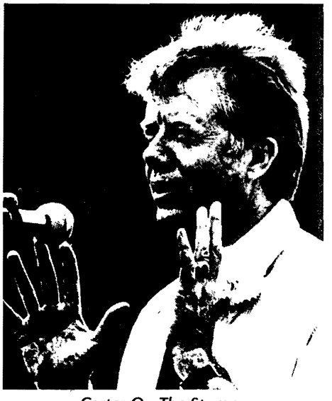
Carter On The Stump

It was black racism, Jewish racism, Mexican racism, Puerto Rican racism and various other racisms, together with a lack of Majority racism, that made the Democratic victory possible. These victories will continue until the Majority becomes as race-conscious as its opponents and until Majority renegades can no longer make successful political careers out of betraying their own kind.