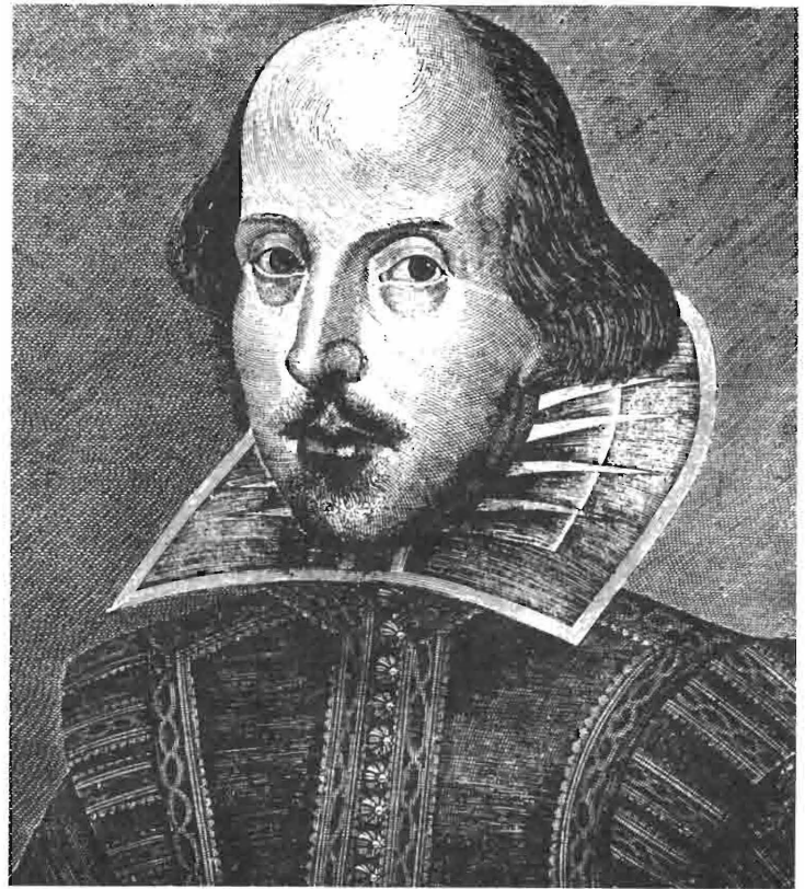
The Bard was ethnically tuned.

Marlowe's Jew of Malta is a Machiavellian monster, who cheats and murders without scruple and evokes admiration from his youthful creator and from the audience only because of the scale of his crimes. Nor was Ben Jonson's view of Jewry any more flattering. The satire of his Alchemist makes it one of the funniest plays ever written.