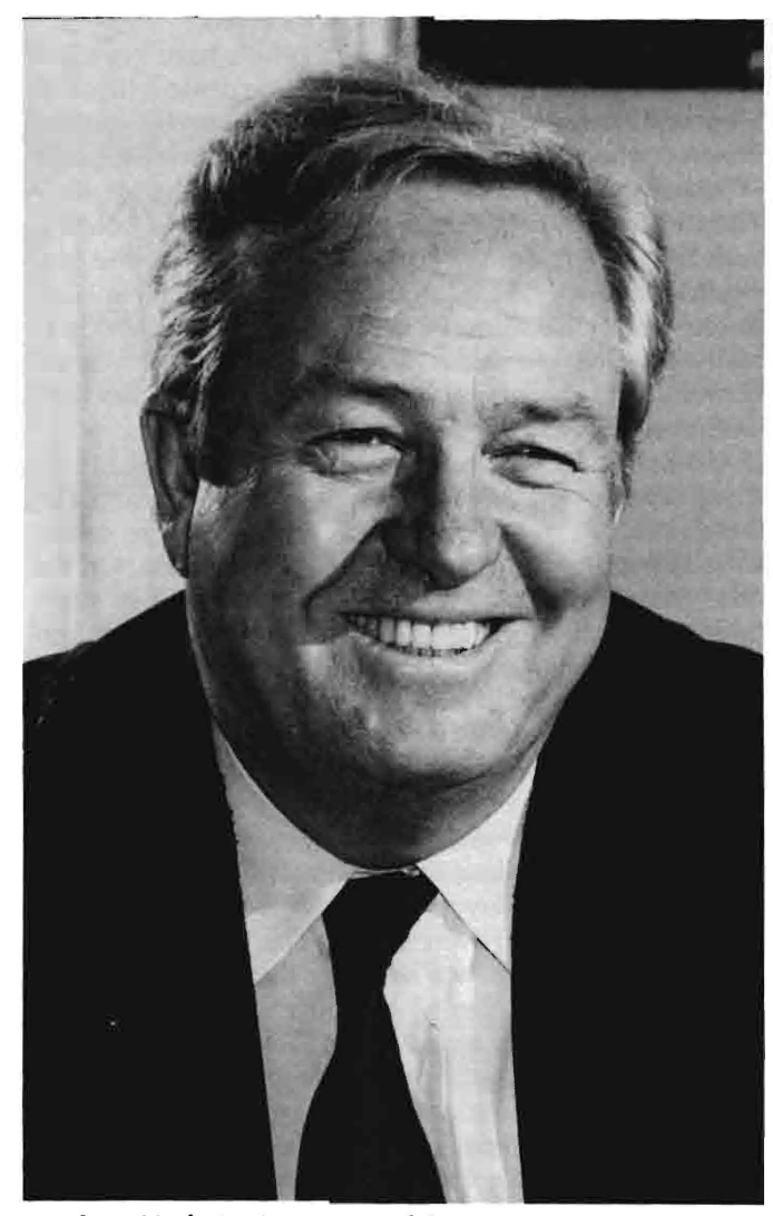
Jean-Marie Le Pen — one delegate, millions of votes.

Although rampant in the four elections, the wave of dirty politics had actually started a few years earlier, when France's sleazy political establishment changed the rules after Le Pen's Front National had amazingly won 35 National Assembly seats in the 1986 election, under a proportional representation system of balloting. PR voting means that the leading candidate in a constituency (similar to a U.S. congressional district) wins, provided he gets 12½% or more of the vote. The new winner-take-all system, on the other hand, calls for a second round, as in the presidential election, if no candidate gets more than 50% of the