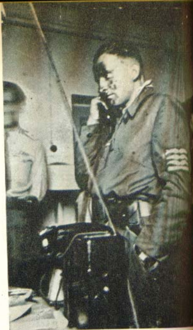
"At the Fuehrer's headquarters in Berlin, January 1, 1945."