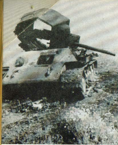
"A perfectly exploded Russian tank (T 34) after direct hit by a Stuka."