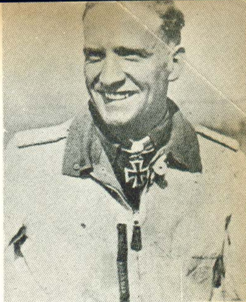
Hans Ulrich Rudel