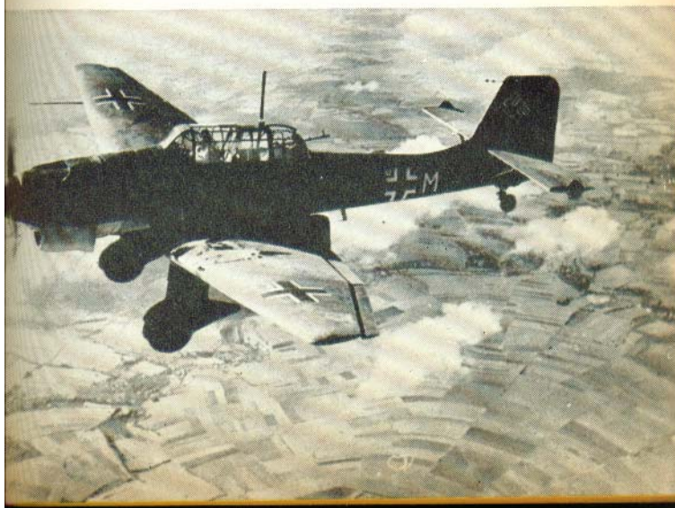
A German dive bomber (Type JU 87) in the air.