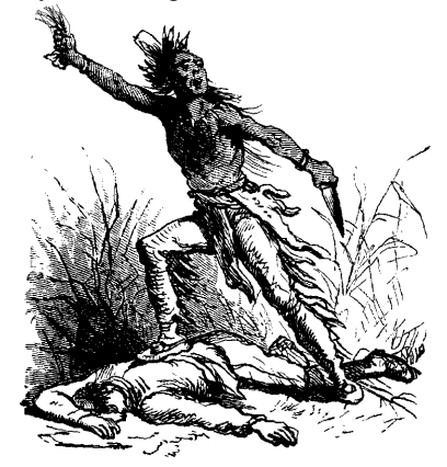
Is this what happened to Kennewick Man?

thought to their political impact. The Chinese have known about the Caucasian skeletons for years but were reluctant to tell anyone about them. As for Kennewick Man, if he turns out to have been Caucasian and killed by Indians, whites may be a little less willing to listen to lectures about how whites committed "genocide" against "Native Americans." These videos suggest whites have a far-flung history that is only now being uncovered.