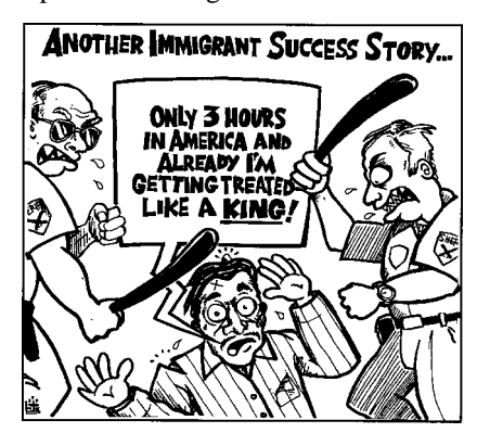
Cartoon from a La Raza publication.

MALDEF opposes securing the Mexican border even to stop the flow of illegal drugs. When the Federal government launched "Joint Task Force Six" to combat drug smuggling along the border, MALDEF filed suit to halt the project, arguing that "it would cause irreparable damage to the human and