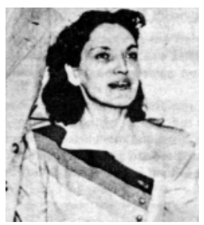
MEChA heroine Lolita Lebrón.

In English, the group's name would be Chicano Student Movement for Aztlan. "Chicanos" are Mexicans living in America, and "Aztlan" is the pseudo-Aztec name radicals want to give to the Southwestern part of the United States after they kick out all the white people and make it an independent country.