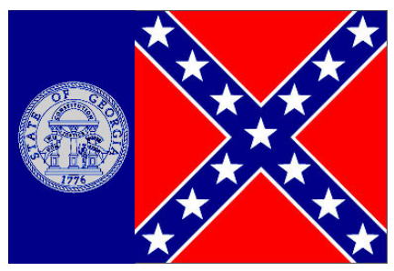
The flag they wanted.

issues, recently decried the leftward tilt of his party, pointing out that many former Georgia Democrats are leaving. What went unmentioned but understood