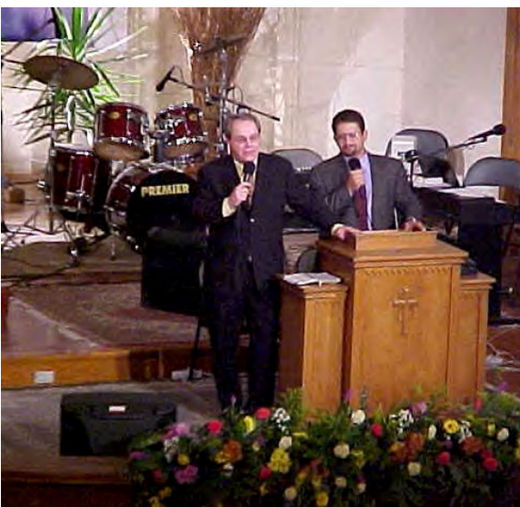
The churches have traded old sins for new ones.

tered. This might be an attractive theory were it not for the fact that white self-hatred seems to be just as common in Catholic countries, and particularly virulent among secularists. Furthermore, the people who perform today's ritual confessions of sexist and racist sin do not