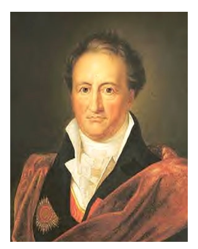
Geothe: Nazi precursor?

cial reform." Once Germans are sufficiently softened up, even letting in swarms of non-white immigrants can be seen as atonement for Nazism. The