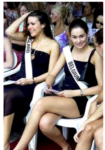
Showing too much leg for Muslims.

The violence went into high gear when ThisDay newspaper published an editorial on Nov. 16, suggesting the prophet Mohammed would have approved of the contest. "He probably