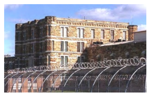
Lansing Correctional Facility. The injection chamber is the corner room on the top floor.

Although they each have four death sentences, it could be a long time before the brothers die. State law requires automatic appeal of death sentences, and the process takes up to three years. Fed-