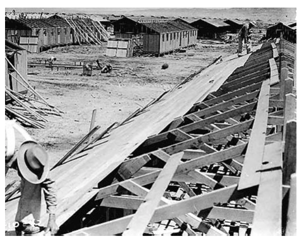
Poston, Arizona, center under construction.

Losses that occurred despite this effort were compensated by means of the