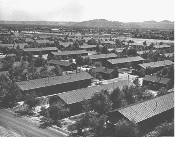
Center at Poston, Arizona.

Many, however, were not loyal. Ninety-four percent of military-age men said they would not serve in the US