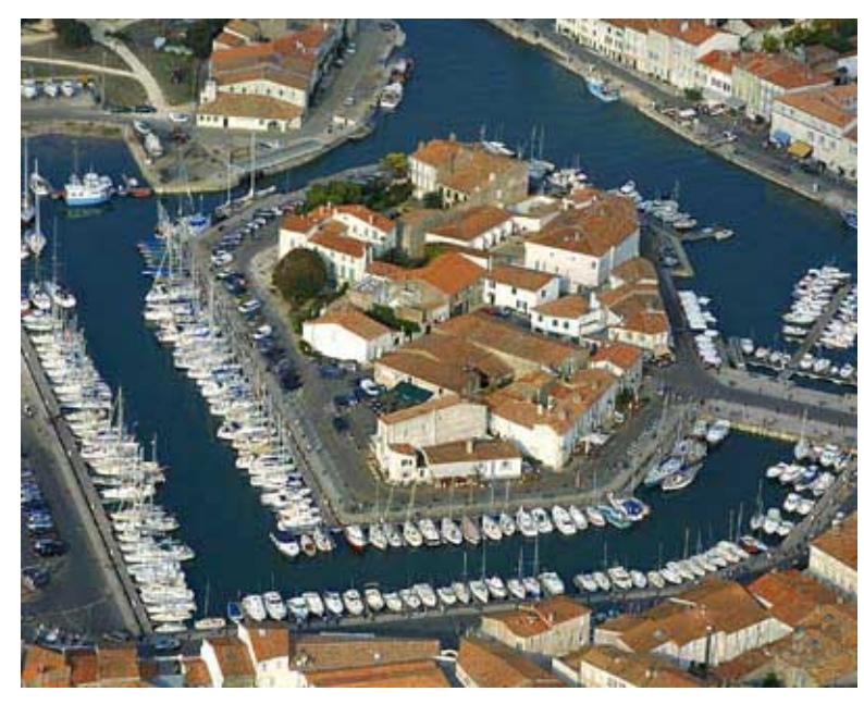
Ile de Ré: Where old Socialists go to get away from multiracialism.

It is perhaps with blacks that the European elite maintains, to some degree, a genuinely colonialist mentality. Our rulers came of age when there were still