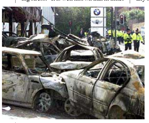
Bradford rioters burned every car at a BMW dealership.

Most ambitiously, however, he includes an interesting analysis of why mass immigration can bring on "crowding stress." It is well known that in times