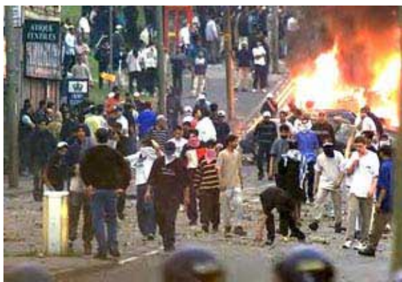
Asians rioting in Bradford, 2001.

The government panicked, halting all applications from Romania and Bulgaria. On April 6 and 27, Prime Minis-