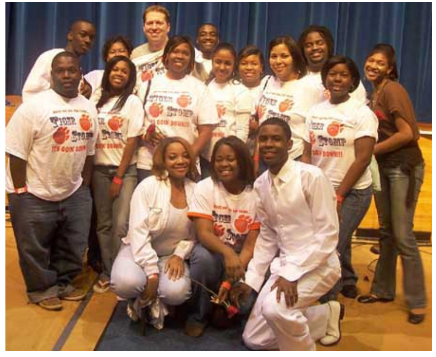
Not the classmates most whites want for their children.

sized swimming pool with an underwater viewing room, television and animation studios, a model United Nations with simultaneous interpreting equipment, a robotics lab, a planetarium, a mock court room with jury deliberation rooms, and field trips to Mexico and Senegal. A former Soviet Olympic fencing coach was recruited for a high school team. There was a $900,000 television campaign to alert whites to the remarkable new improvements. If white students were not on a bus route, the city sent taxis.