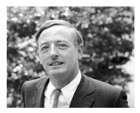
Buckley: an ex-conservative.

In the beginning, National Review really did defend a traditional view of the American republic. As James Lubinskas has shown in a comprehensive AR article ("The Decline of National Review," Sept. 2000), the magazine took racial differences in IQ for granted, scorned Martin