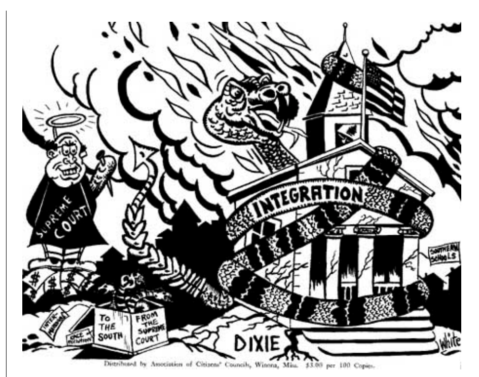
There was 'massive resistance' in parts of the South.

In some areas there was a massive shift to private schools. In the Denver metropolitan area an astonishing 94 percent of white students attended private schools in 2005. A Duke University study found that in ten counties in Mississippi more than 90 percent of white students were