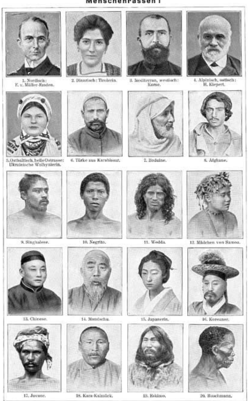
All in the name of "racialized" oppression.