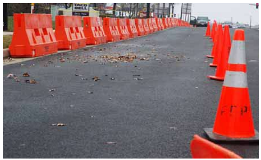
Police barriers in front of the conference hotel.

Today, non-native concepts have found their way into African languages, but it is important to distinguish between