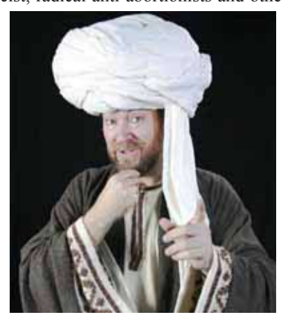
Put him in the society column.

— When writing about terrorism, remember to include white supremacist, radical anti-abortionists and other