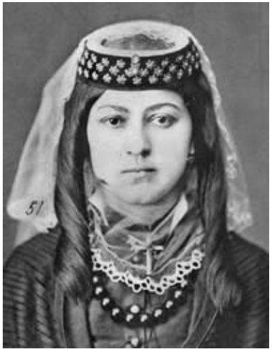
A Georgian beauty.

concluded that racial characteristics were irreducibly biological, given that these characteristics persist from generation to generation, and that racial mixes produce what are clearly half-breeds. Like most men of his time, Kant did not think highly of Africans, concluding that they "have by nature no feeling that rises above the trifling."