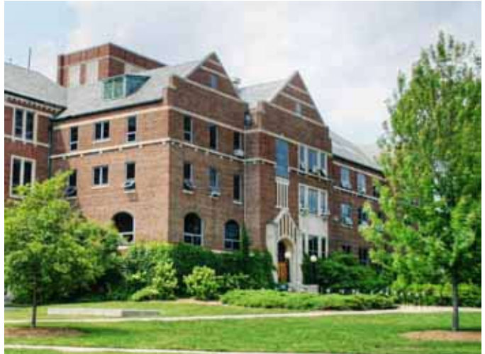
MSU Student Union.