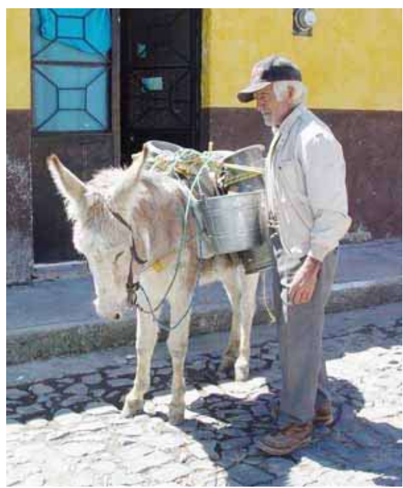
No longer a common scene.

Why, then, do so many Mexicans want to leave? The population mix is part of it. Perhaps 10 percent of the population is white, and they are the government and professional elite. They live well and seldom come north. The mass of immigrants are Mestizos, who make up some 60 percent of the population, although there are increasing numbers of