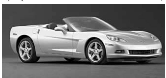
No different from a school bus.

that convertibles, two-seaters, and SUVs were distinct classes, while others might say they were all cars. There would be