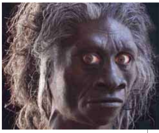
Not to be mistaken for a Dane.