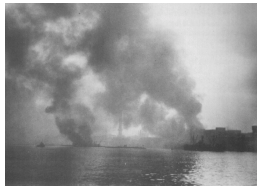
London docks ablaze after a German mass fire-bomb raid in September 1940. This photograph was censored at the time and not released for publication for many years. It was marked, 'Not passed by censor.'