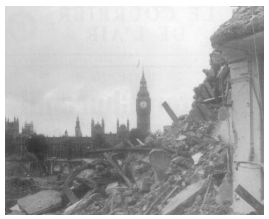
Churchill's vision of London in ruins came true - and there were those who said he would not have wanted it otherwise.