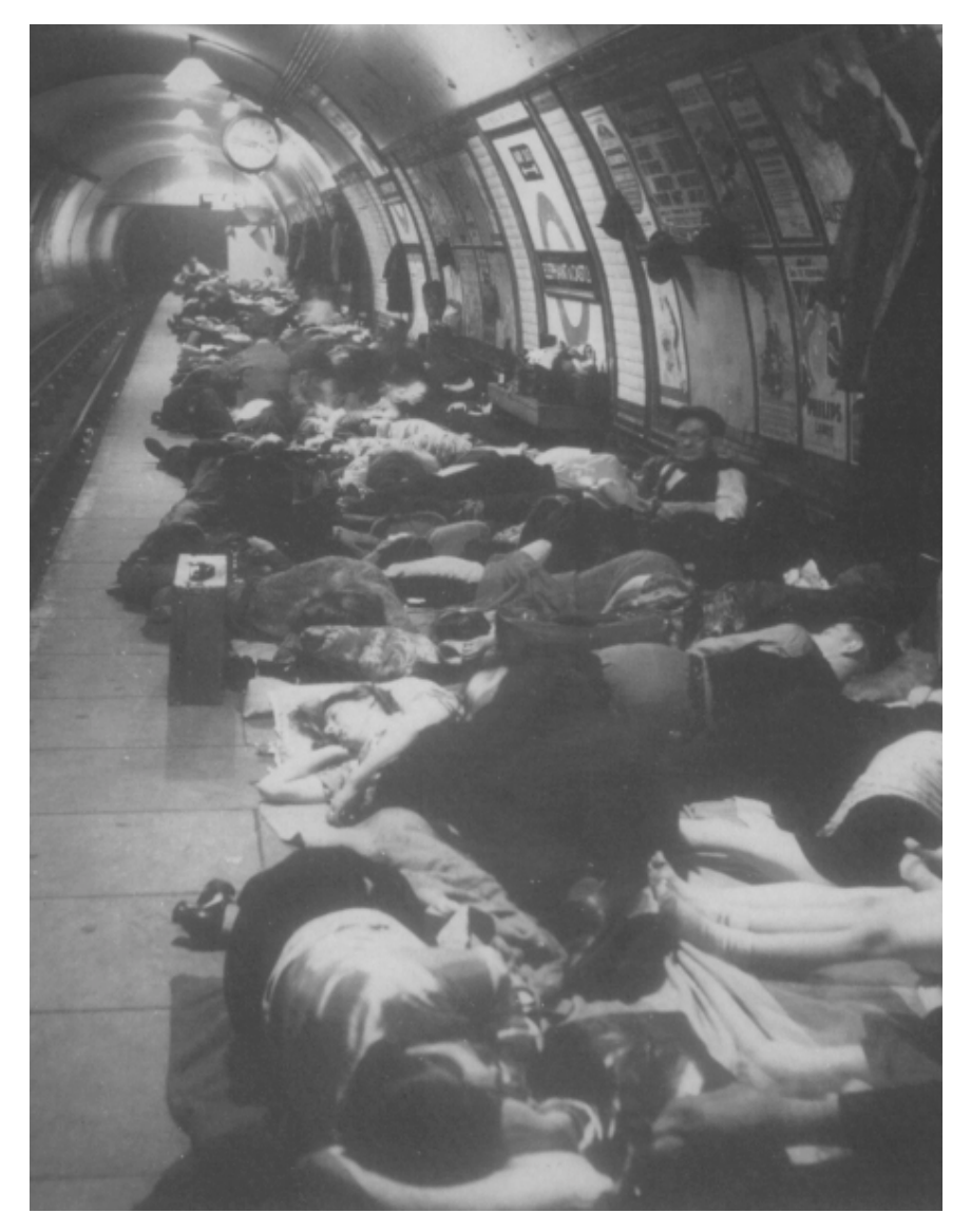
While London's wealthy and influential slept soundly in the bombproof cellars of the Dorchester Hotel, and while Churchill left by the back gate of No. 10 Downing-street for his hideout in Oxfordshire, the working class took refuge in squalid conditions in the city's subway stations.