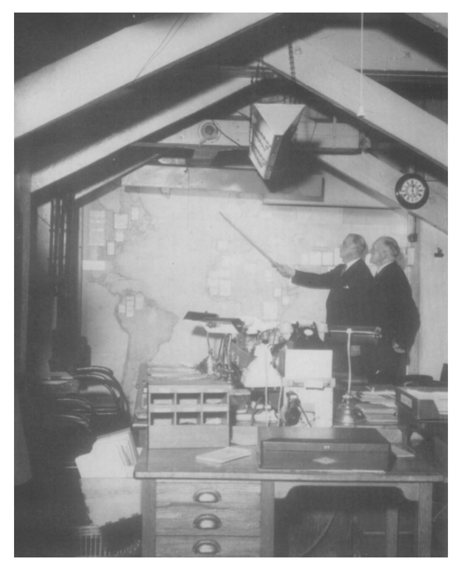
The secret underground headquarters of the war cabinet and the chiefs of staff in Marshamstreet, Westminster, London. The building, designed to hold over 2,000 people, included radio and power stations. Shown here is Lord Ismay in the map room of the underground headquarters. With him is Mr G. Ranse, to whom all correspondence was addressed during the war, when the war cabinet offices were a top-priority secret.