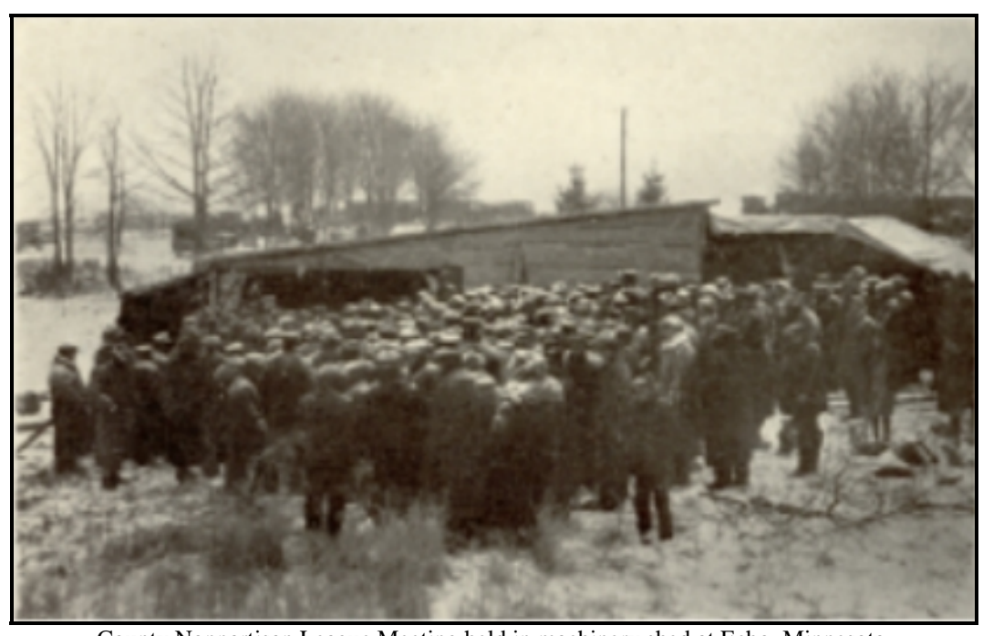
County Nonpartisan League Meeting held in machinery shed at Echo, Minnesota, because of refusal to allow meeting in town.