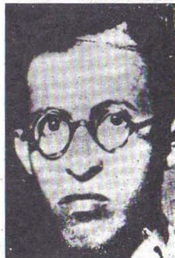
MENACHEM WOLFOVITCH BEGIN