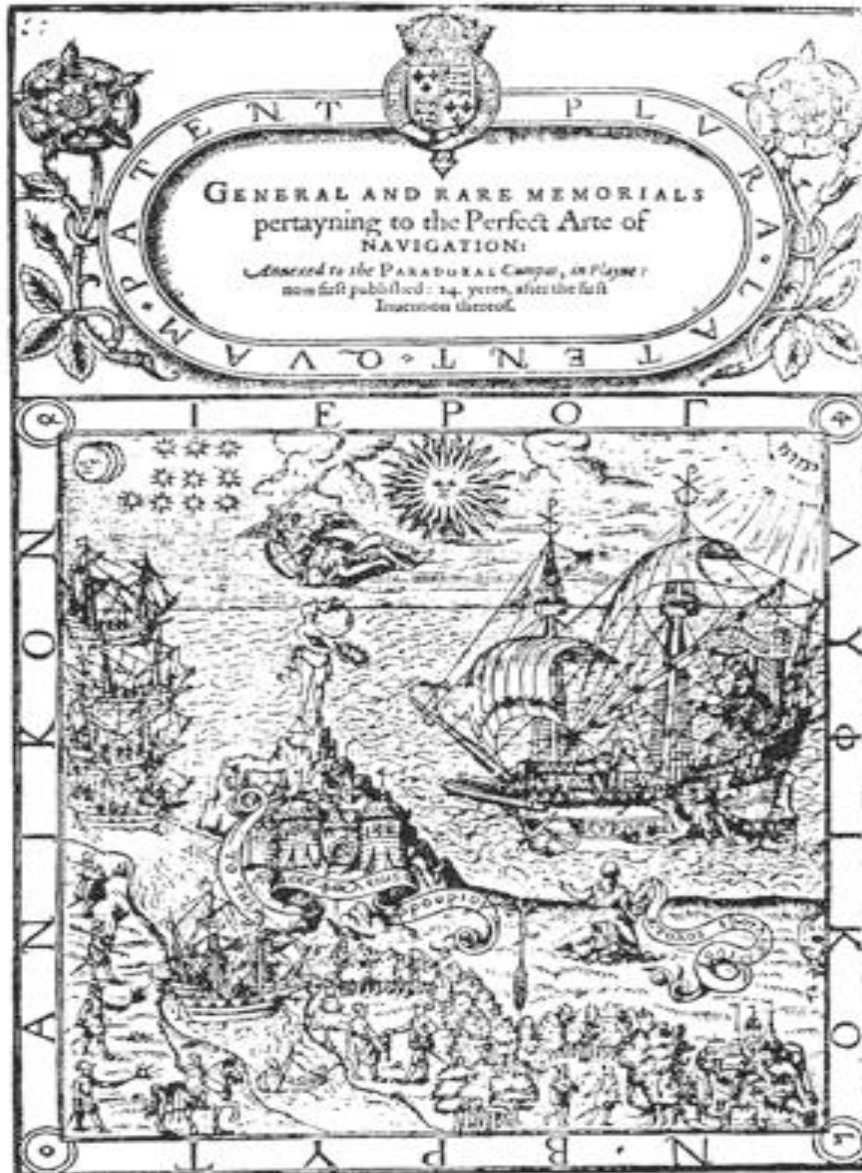
11 John Dee, General and rare memorials , 1577, title-page

Thus, the first legal agreement or constitution in the New World was followed in 1661 by a Declaration of Liberties, dated June 10, 1661, in General Court, which included: "2. The Gouvernor & Company are, by the pattent, a body politicke, in fact and name. 3. This body politicke is vested with power to make freemen .... " This Declaration is an important document in the history of this nation, because It announced that we now possessed the power of sovereignty, that is, the right to make freemen. On October 2, 1678, the colonists boldly announced that "the laws of England are bounded within the fower seas, and doe not reach America."