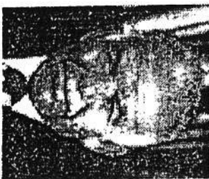
Yitzhak Shamir, (Israeli Prime Minister). Former deputy leader of the NMO, (Israeli Freedom Movement) that offered to join the war on the Nazi side.