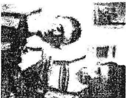
Adolf with his Jewish friend, Emile Maurice, in prison. Emile founded the Nazi-SS and became SS member 2. Adolf was member 1.