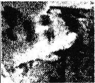
Israeli diplomat Scher, wanted by Interpol & Brazilian police for child prostitution and porn ring

from Soviet domination must be extradited as "war criminals", yet we would not suspect that Israel is a safe haven for