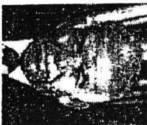
Yitzhak Shamir, (Israeli Prime Minister). Former deputy leader of the NMO, (Israeli Freedom Movement) that offered to join the war on the Nazi side.