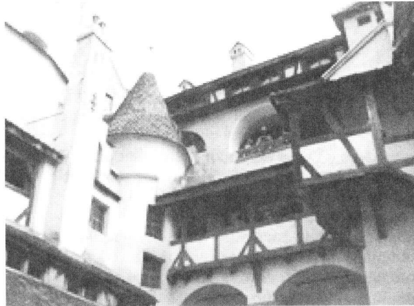
Some of the beautiful Romanian architecture.