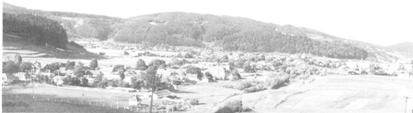
Romania has some beautiful landscape such as found in this view.

Ladies and gentlemen, you cannot have more than one paramount value. If a certain thing is your highest value, that means that all other things are of lesser or no value. Kerry says "The security of Israel is paramount." Not the security of the United States. Not the security of our children's future. Not the security of Western civilization or its founding race. None of these are paramount to Kerry, or for that matter Bush or any of the bought politicians. The Jewish state alone is paramount. (In one of those coincidences that is simply too funny to