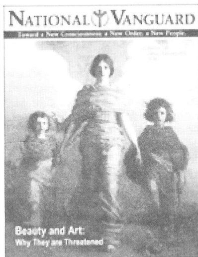
Beauty and Art: Why They Are Threatened: Issue 125, January-February 2005