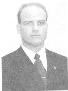
By Shaun Walker, NA Chief Operating Officer

The old tradition of using the poorly armed troops, the velites , in light armed skirmishers at the beginning of battle still existed by 133 BC. The main purpose of these velites were