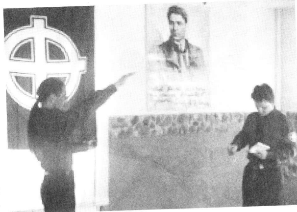
The swearing in ceremony for Noua Dreapta features one hand grasping the Celtic Cross/Wheel flag and the other giving the Roman salute.

The next morning, approximately 11 hours later, Sellers and Conley obtained some matches and a can of gasoline, returned to the car,