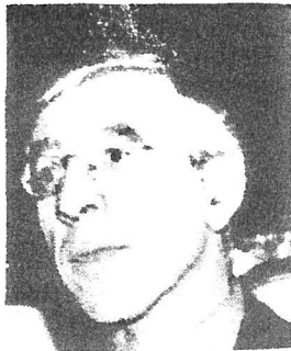
BRITAIN'S FOREIGN SECRETARY Jewish Jack Straw, a chief player in Blair's war upon Iraq for the sake of Israel,

THE ATTACK ON THE TWIN TOWERS OF THE WORLD TRADE CENTRE IN NEW YORK. Was it what Bush has made it out to be?