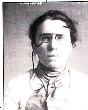
Emma Goldman, a Jewish communist, was a major proponent of abortion, and was the motivating influence on Margaret Sanger, who later abandoned the Jewish position in favor of racial health and eugenics.

While the Middle Ages were packed with a hodge-podge of Jewish cults, isolated from the formal hierarchy of the Temple, who practiced child sacrifice in a hodge-podge way, some believing