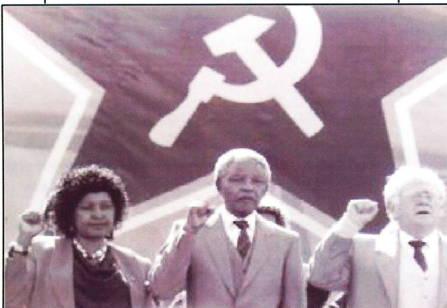
Nelson Mandela and Jew-communist Joe Slovo pose.

and the Education Department seems to think the remedy is "prayer". "Equal Education" has filled even the best schools with primitive characters, introducing stabbing, rape, teen pregnancy and general insecurity as dominant distractions from study. Religion has been replaced by the