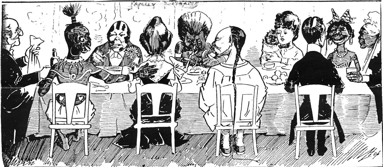
PIEBALD POSSIBILITIES-A LITTLE AUSTRALIAN CHRISTMAS FAMILY PARTY OF THE FUTURE

Was part of ALP policy to rule through elite or 'peak bodies'. Also ushered in rule by Hawke's 'kitchen cabinet' of billionaires, another 'peak body': Alan Bond, Robert Holmes A'Court, Christopher Skase, Arvi Parbo. We went from being a Parliamentary Democracy to a fiefdom of plutocrats. This is what a return to ALP rule promises. Big Media, Big Business and Big Unions at the top table. For the other 20 million of us - the doghouse.