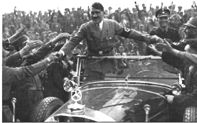
Beloved of his people, the German Fuhrer, Adolf Hiedler gave them prosperity, greatness, and joy.