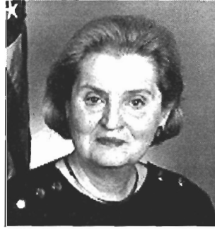
Madeleine Albright Secretary of State, Clinton Administration