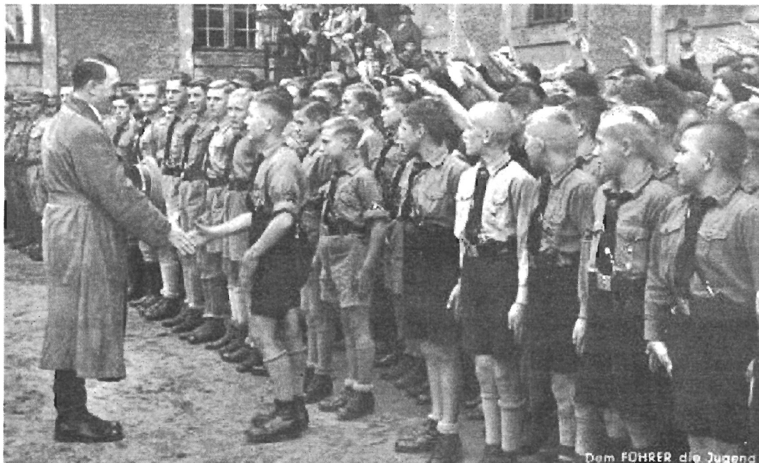
These beautiful German children are what the Jews called "thugs". They were massacred by the millions. They fought and died for their homeland.