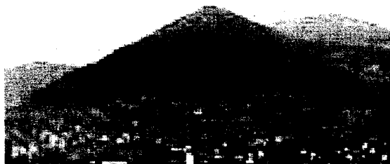
Pyramid shaped hill rising above the town of Visoko, thought to hide a 12000 year old pyramid under its earth and vegetation