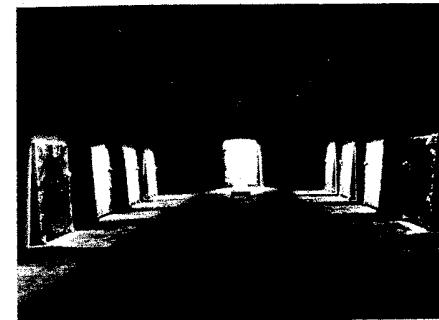
Ofili's acclaimed "The Upper Room" - monkeys and elephant dung

Upper Room" , which historically refers to Jesus Christ's Last Supper, in an upper room where His disciples hid "for fear of the Jews". Jesus washed His disciples' feet at this last gathering before Gethsemane and His Crucifixion. He also instituted the rite of the Eucharist meal.