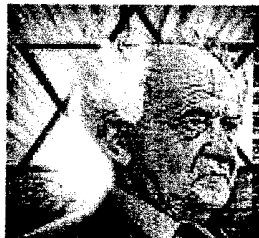
Ben Gurion, first Prime Minister of Israel, so-called "moderate", called for a "Greater Israel"

The media portrayal of the current conflict is blatantly absurd. It has nothing to do with "captured soldiers" or Israel's "right to defend itself". This is a traditional war with clear territorial and political objectives. The