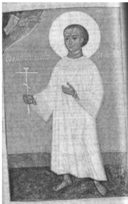
The child-martyr St. Gabriel of Bialystok, done to death by the Jews in 1690

Thirty years later the surrounding land was struck with a horrible epidemic. Peasants sought to bury their children as close as possible to Gabriel's grave, believing in his power of heavenly intercession and patronage of deceased children. During one burial Gabriel's grave was damaged, revealing his imperishable remains. This happened in 1720.