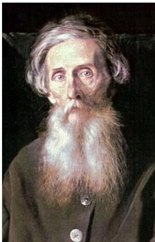
V.I. Dahl (1801-1872), author of the famous dictionary, researched Jewish ritual murder at the behest of the Tsarist government.

Writers especially sympathetic to the Jews boldly announce: "Well, what of it, if some unwashed hasidim actually did cut up a Christian boy? Among Christians are those who've engaged in ritual evildoing too... Monstrosities can be found in all religions." I'll answer by saying that there are monstrosities and there are monstrosities. Are Christians who serve black masses normal? One can't assert that Christians who've gone off the deep end in this regard are acting in accordance with their laws, but with the Jews, alas, one may, for the Talmud prescribes all manner of crimes in relation to Christians(2).