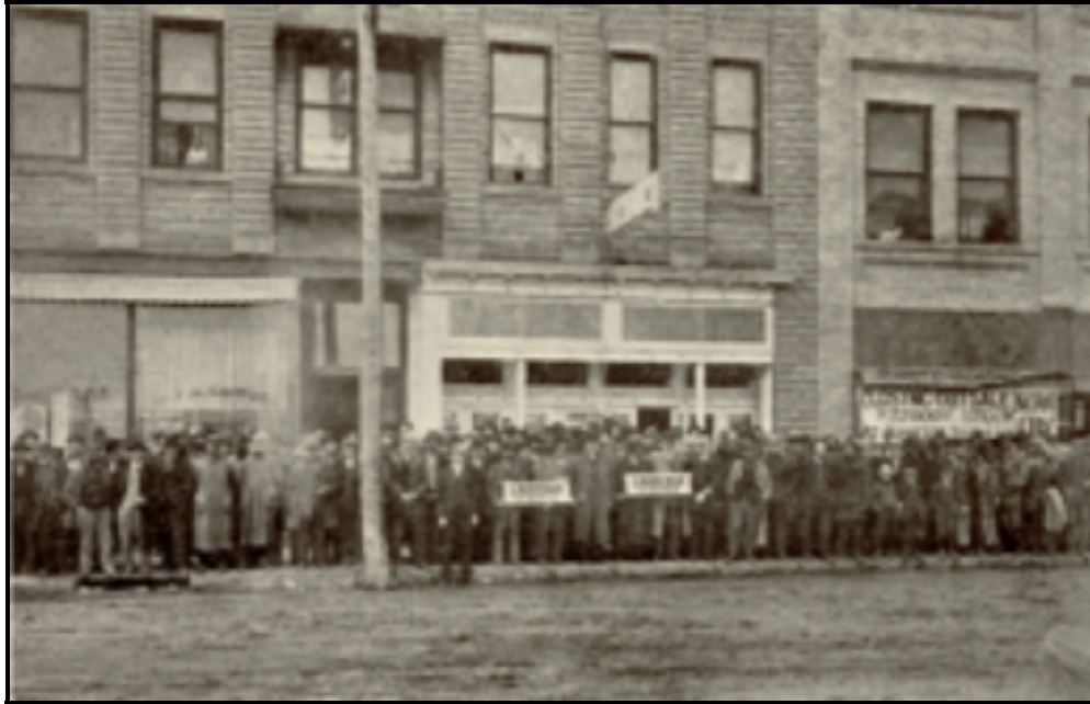
Lindbergh-for-Governer meeting at Detroit Lakes, Minnesota, April 26, 1918, Lindbergh standing between banners.