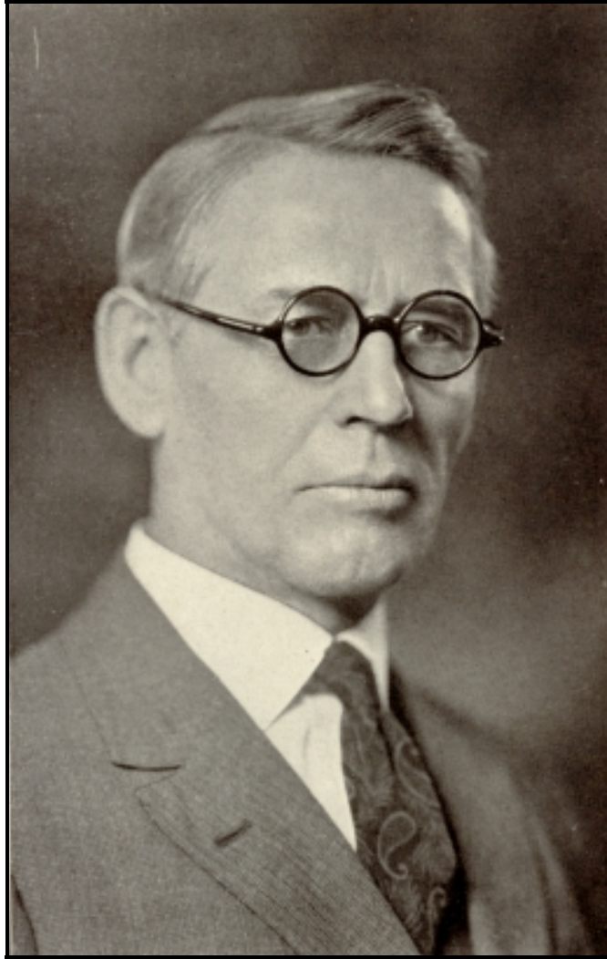
Last picture of Charles A. Lindbergh, Sr., taken January, 1924. He died May 24, 1924.

natural resources and the products of the people's daily toil furnished temptations to speculators. They required certain laws to secure special privilege. These they sought and secured by tempting those in political power. The laws were made to suit the tempters, which accounts for the shift of the wealth from the producers to the speculators.