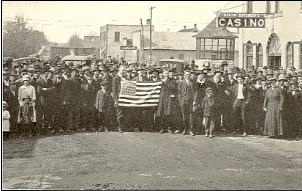
Lindbergh-For-Governor meeting at Detroit Lakes, Minnesota, April 26, 1908, Lindbergh standing between banners.

Mr. Citizen: Oh, no, Mr. Politician, we want to get the money from the Government! The Government already loans to the banks treasury funds at 2 per cent, while the banks have loaned that money at 10 per cent and more for small loans. Besides, just now the banks will make us no loans. They say they don't know what the war will bring, and offer us no encouragement. We have got to have help now, or our crops will rot in the fields.