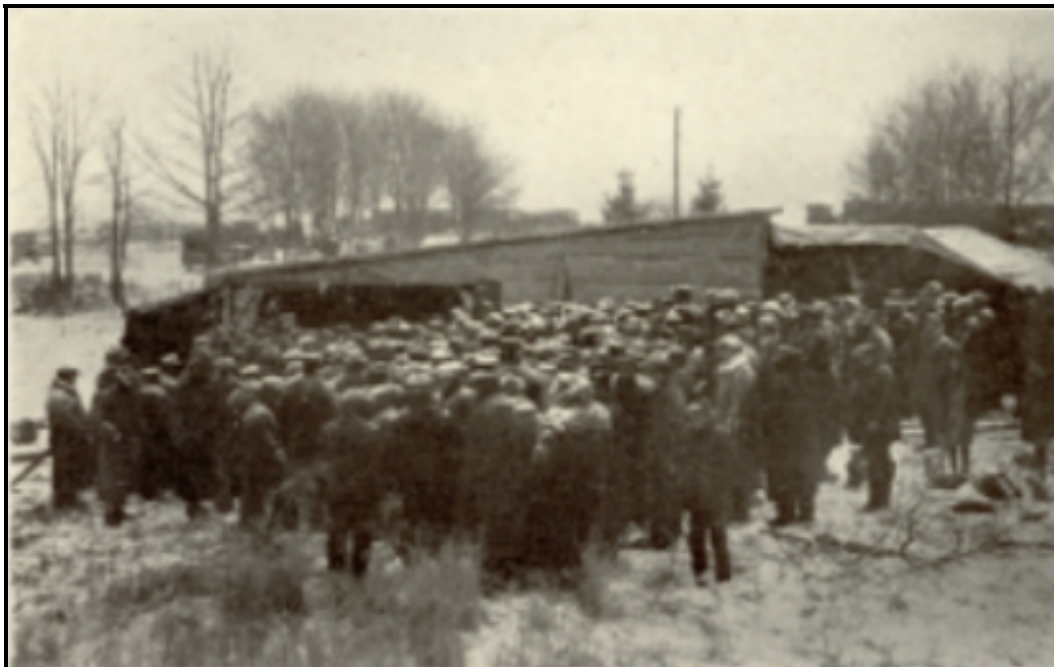
County Nonpartisan League Meeting held in machinery shed at Echo, Minnesota, because of refusal to allow meeting in town.